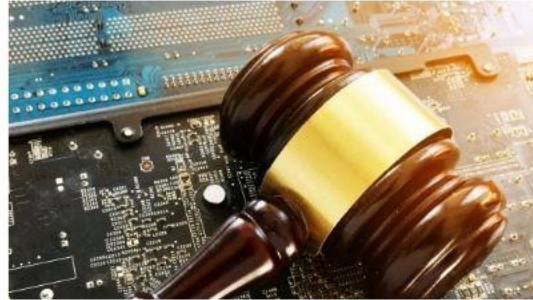
REGULATION & COMPLIANCE