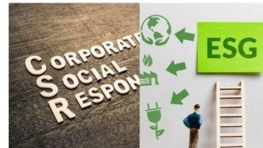
CSR TO ESG